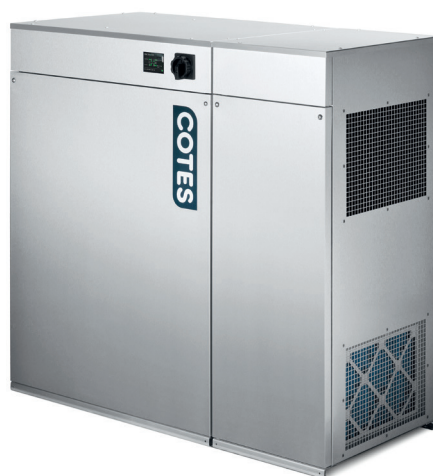
C35 DEHUMIDIFIER WITH HEAT RECOVERY MODULE