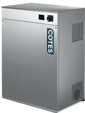
C35 DEHUMIDIFIER (model shown with PLC)